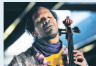
The Soloist (pictured above)

With the now-deceased Jigsaw still directing events from beyond the grave, Hoffman emerges as the next heir to the killer's twisted legacy.