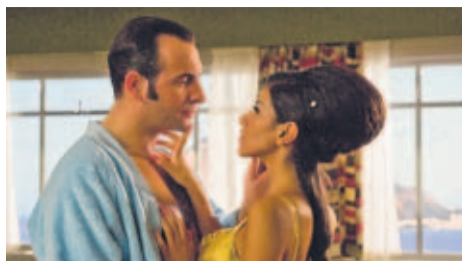
OSS 117: Lost In Rio (France, 101 minutes)

After nearly 3300 miles of heartbreaking effort, he emerges successful. But what price success?