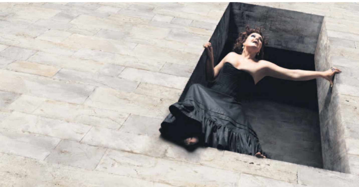
A FINE FINN: Finnish soprano Karita Mattila's performance in the title role of Tosca for the Metropolitan Opera (above) is the first time she has sung the part outside her native country.

For daily listings, check the classified advertising pages of The Gisborne Herald.